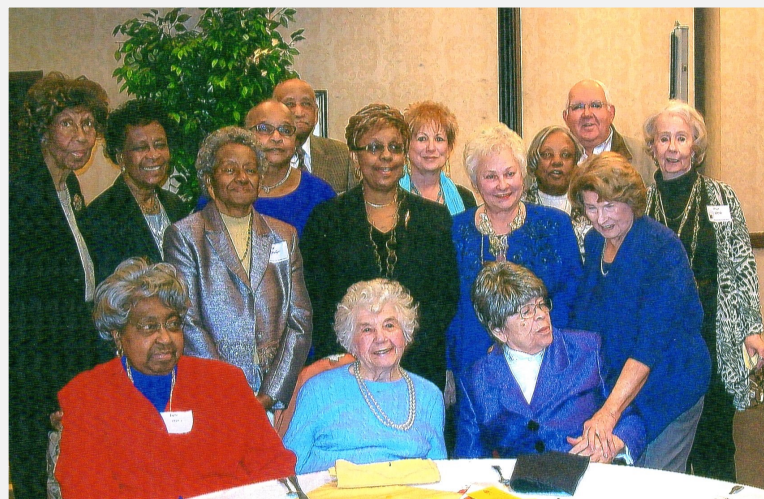
Past Presidents of PGPSRA gather for a post-party photo.